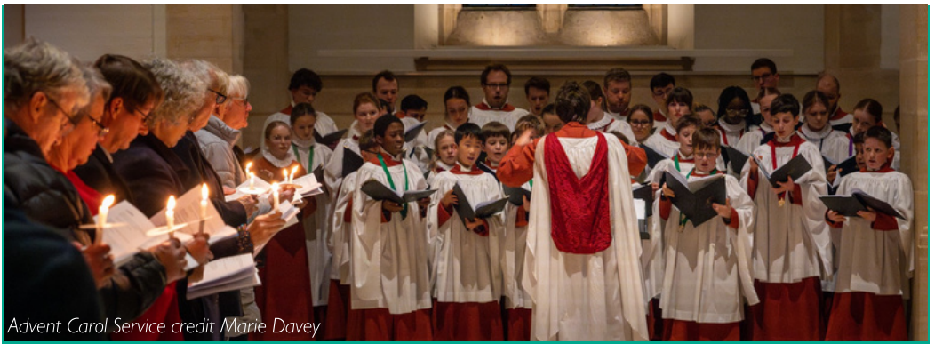
Advent Carol Service