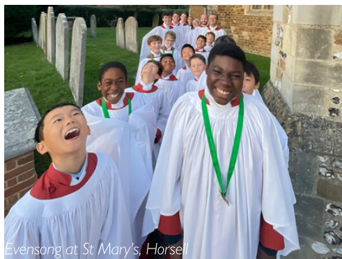
Evensong at St Mary's, Horsell

It is one of our joys that we get invited to celebrate with other churches and parishes in the area, and this term, we were also invited to sing at St Nicholas', Guildford as they celebrated their Patronal Festival on Wednesday 6th December.