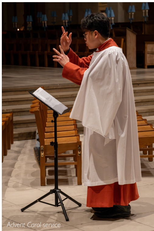
Advent Carol service