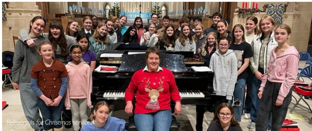
Rehearsals for Christmas services