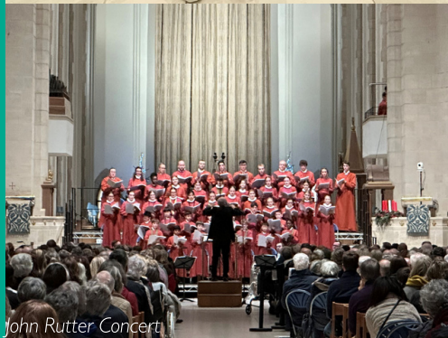
John Rutter Concert