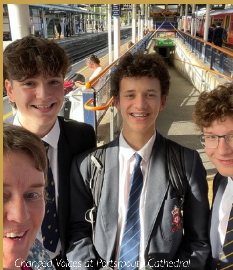
Changed Voices at Portsmouth Cathedral

The Cathedral choir sang its termly diocesan service at St. Nicolas' Church, Guildford in celebration of that parish church's patronal festival.