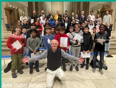
John Rutter Rehearsal