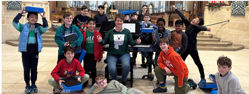
Rehearsals for Christmas services

Welcome all, and good luck in your new roles!