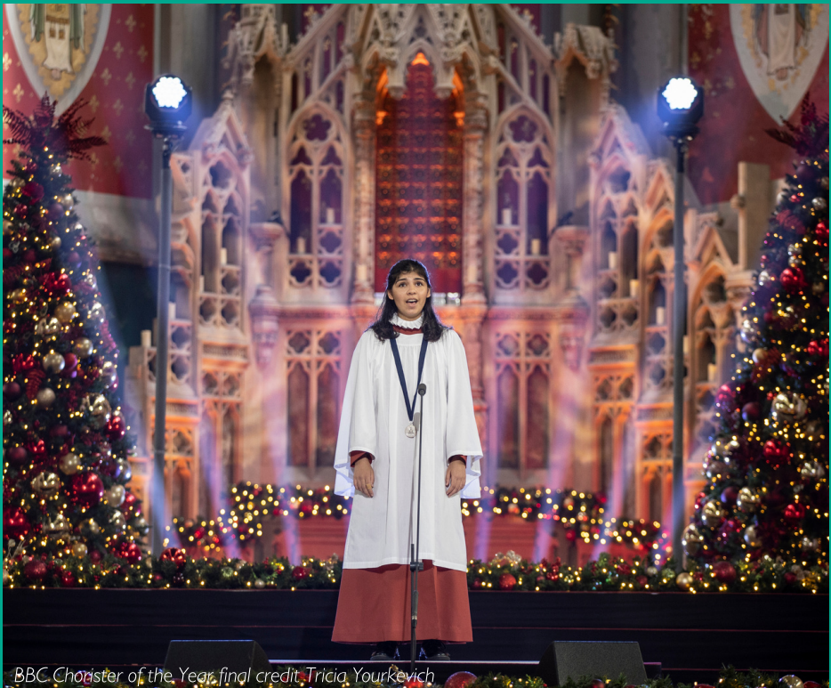
BBC Chorister of the Year final