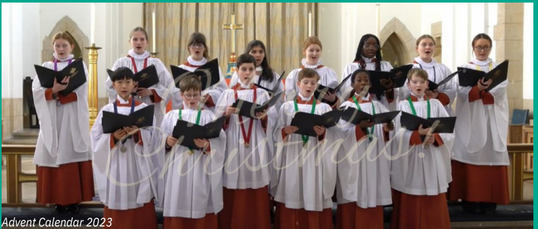
Advent Calendar 2023

For the third year running, Guildford Cathedral posted an online advent calendar on social media, giving our followers the joy of hearing our musicians give a snapshot every day in December. As each day's offering was released, our followers were able to pause for a moment and enter into the anticipation of Christmas. If you missed it, you can still listen to them all on our Youtube channel.