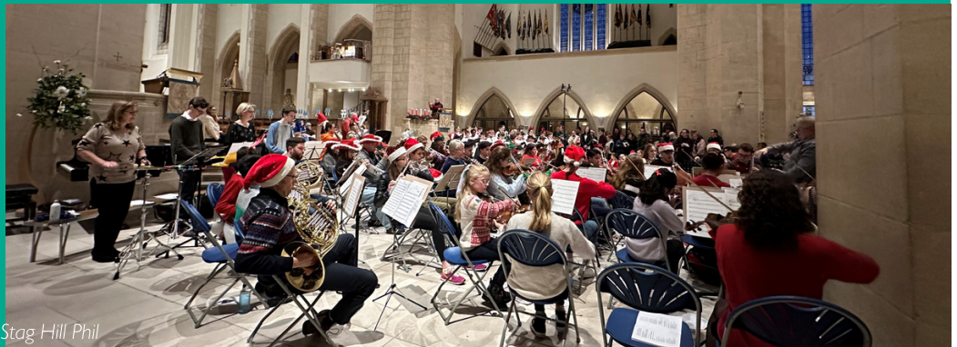
Stag Hill Phil

Over Christmas Eve and Christmas Day, our musicians sang in five services, and some also participated in Journey to Bethlehem, our Nativity service aimed at families – Christmas is a lot of work for them, and they deliver the music so well that it raises our worship to another level, and it is a favourite time of year for many. It also saw some former choristers come 'home' for Christmas to sing with our choristers and Lay Clerks.