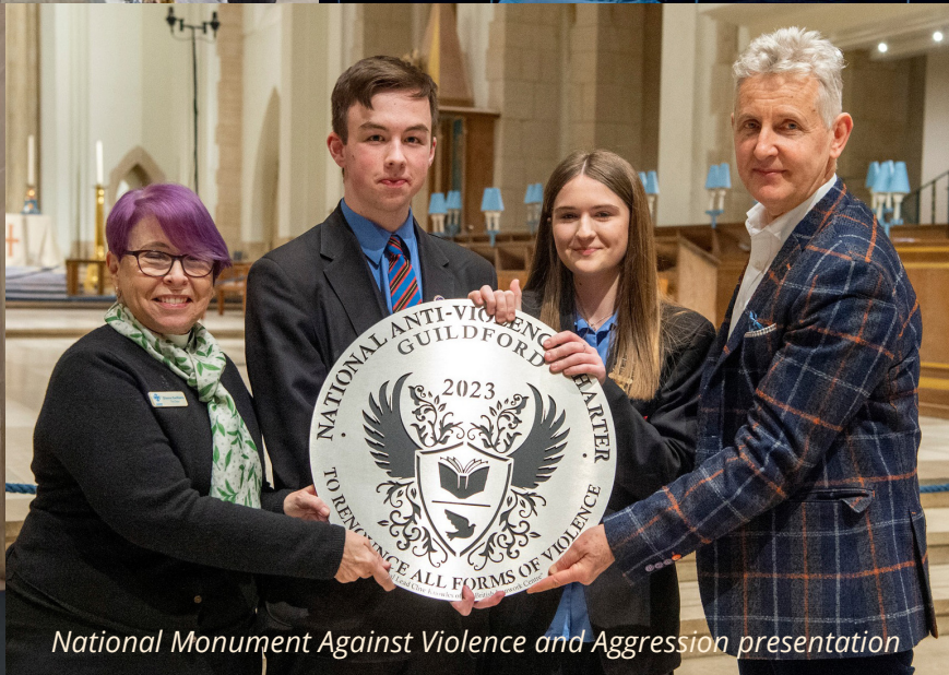
National Monument Against Violence and Aggression presentation