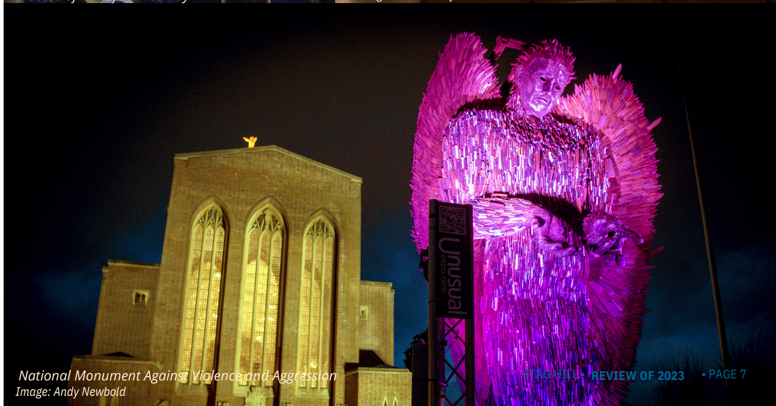
National Monument Against Violence and Aggression