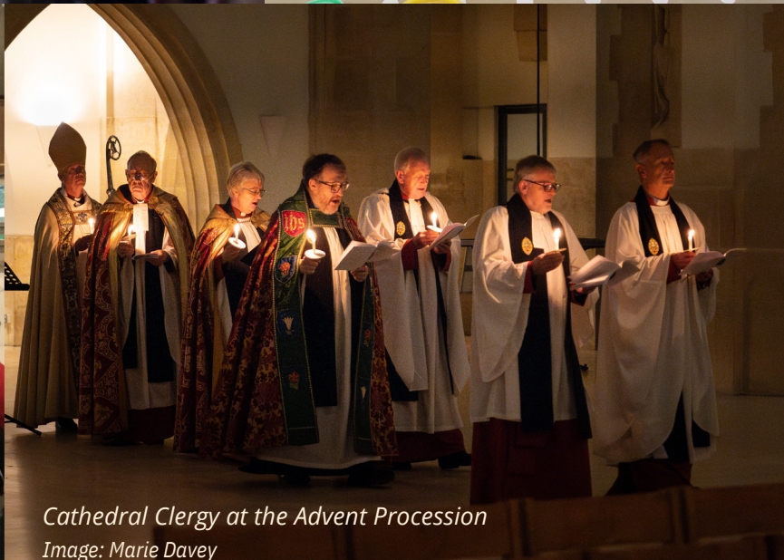
Cathedral Clergy at the Advent Procession