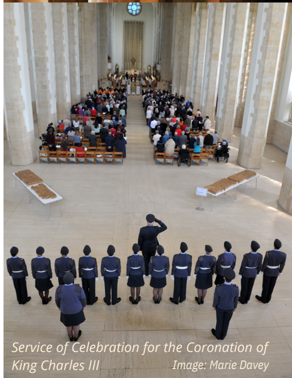
Service of Celebration for the Coronation of King Charles III