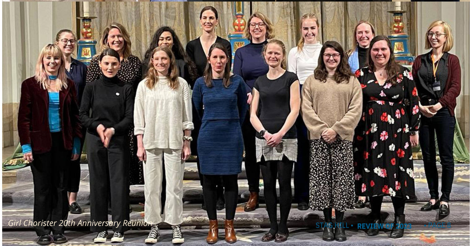
Girl Chorister 20th Anniversary Reunion