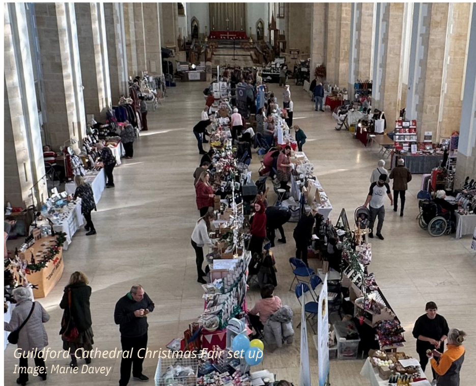
Guildford Cathedral Christmas Fair set up