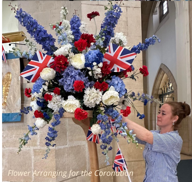
Flower Arranging for the Coronation