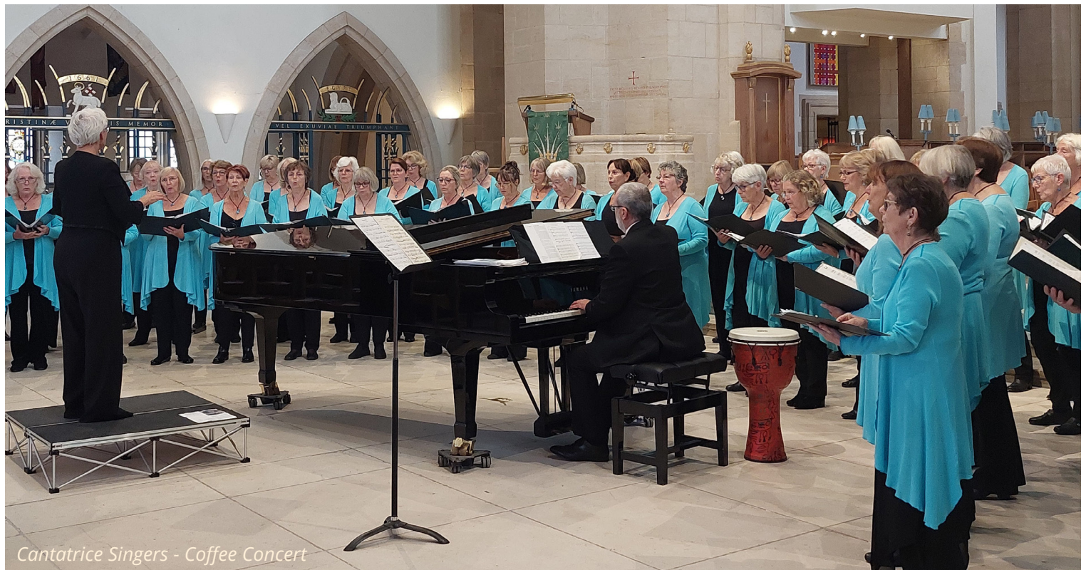
Cantatrice Singers - Coffee Concert