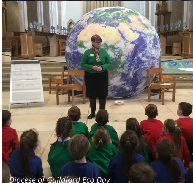
Diocese of Guildford Eco Day