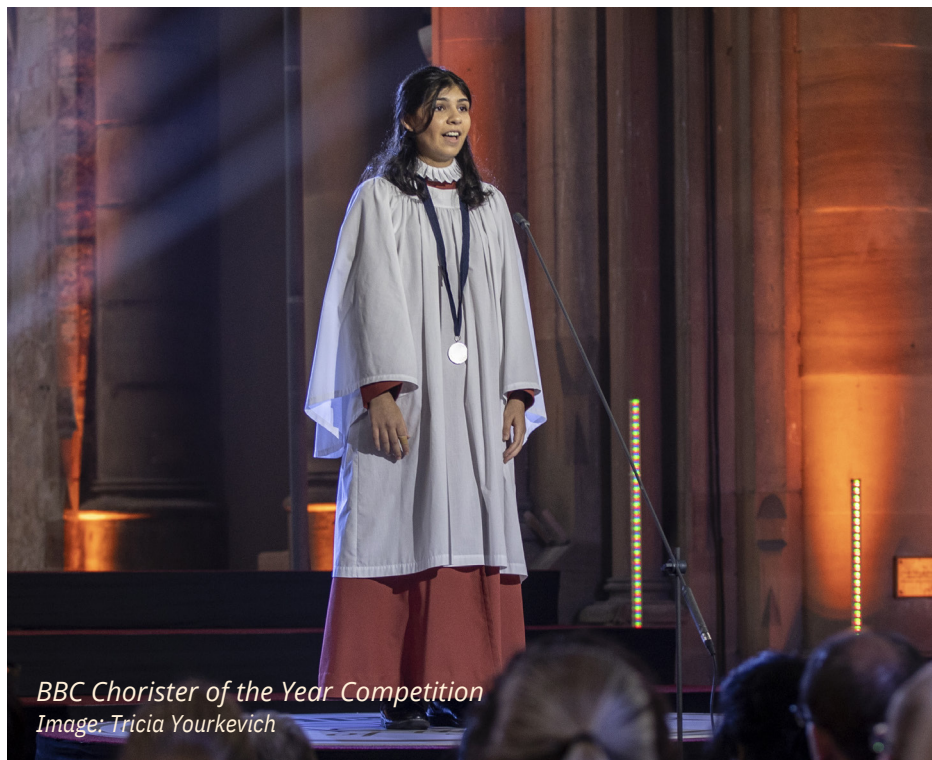
BBC Chorister of the Year Competition