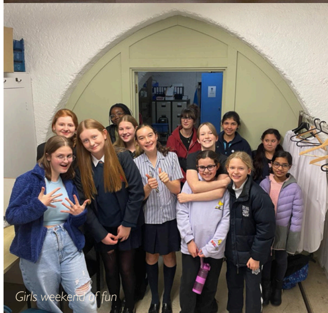
Girls weekend of fun