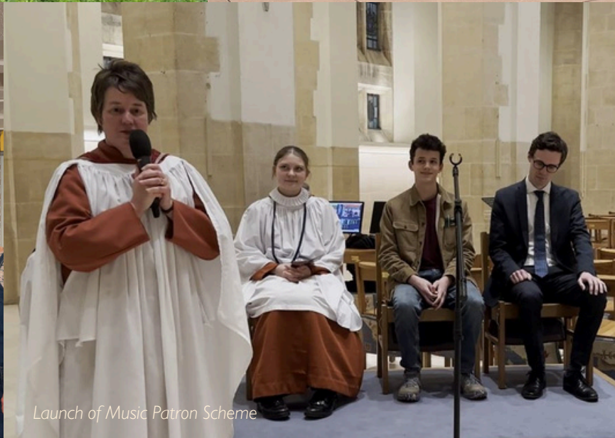
Launch of Music Patron Scheme