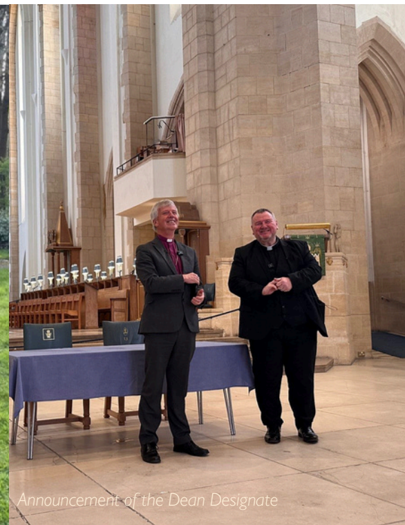
Announcement of the Dean Designate