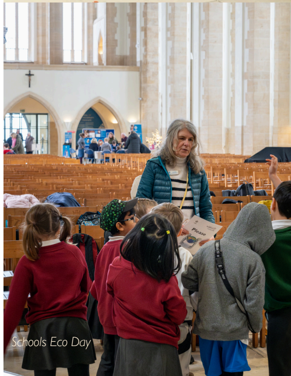
Schools Eco Day