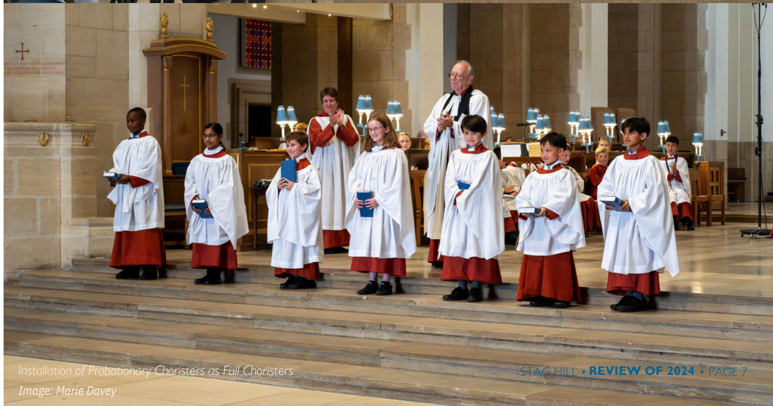
Installation of Probationary Choristers as Full Choristers