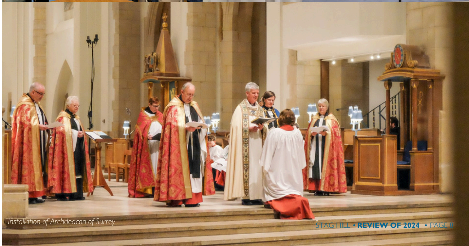
Installation of Archdeacon of Surrey