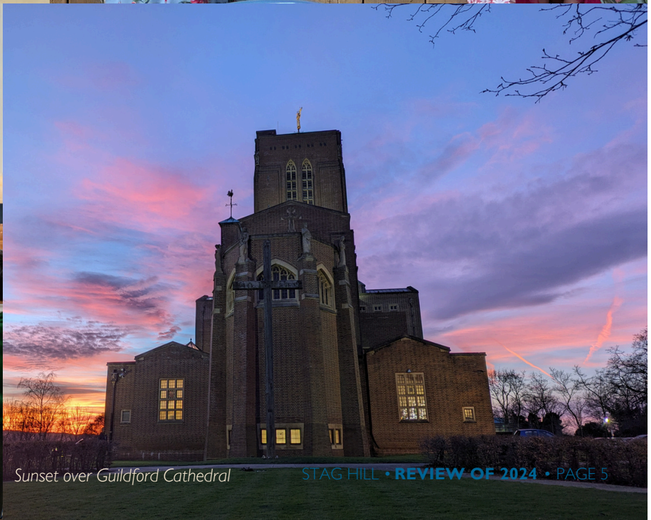
Sunset over Guildford Cathedral