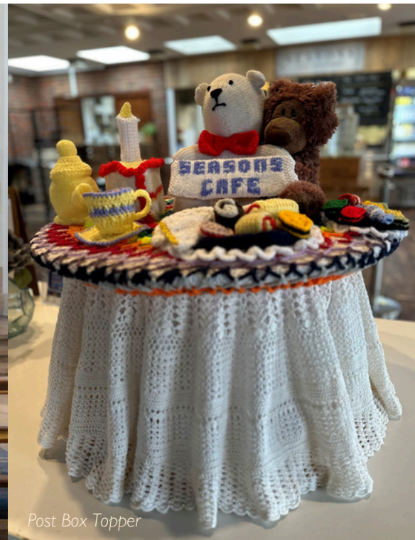
Post Box Topper