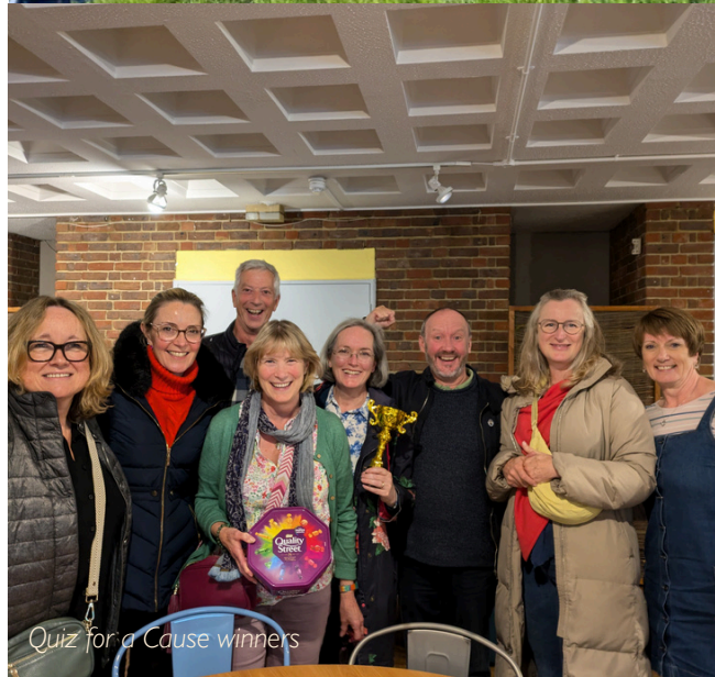
Quiz for a Cause winners