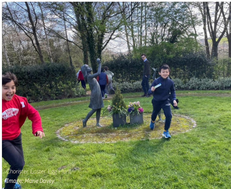
Chorister Easter Egg Hunt