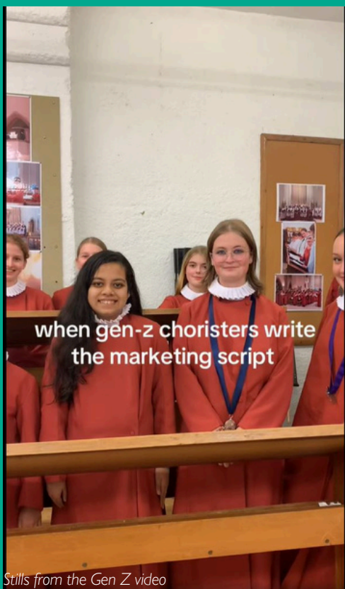
Stills from the Gen Z video