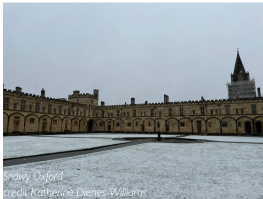
Snowy Oxford