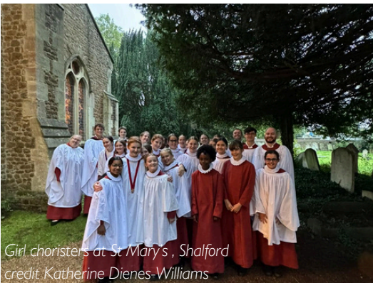
Girl choristers at St Marys, Shalford